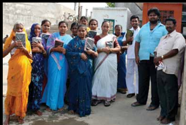
Receiving their own Bible brings joy and hope