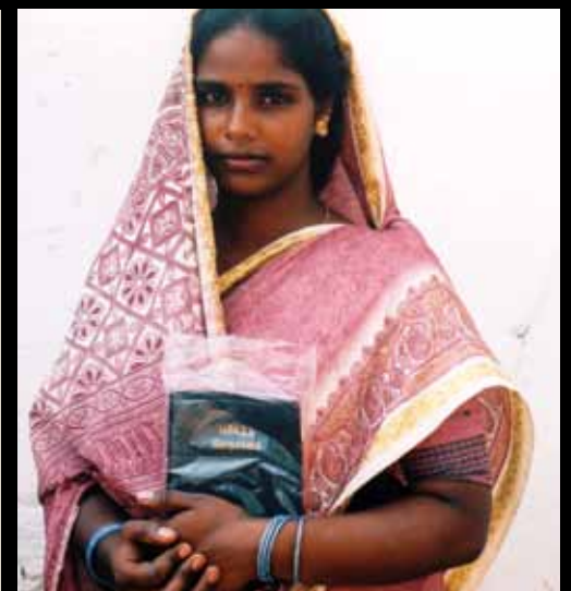
A young Indian woman discovers the Truth in God's Word

"May God be gracious to us and bless us and make His face shine upon us, [so] that Your ways may be known on earth, Your salvation among all nations" (Psalm 67:1-2).