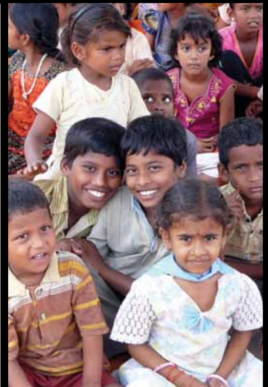
Happiness is making friends for the first time