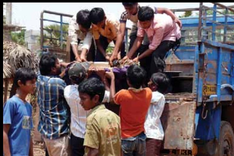
Boys from Grace Evangelical Orphanage serve their community

Benefits of EFT contributions: Secure, saves postage, no delays in service, automatic, you can stop payment at any time.