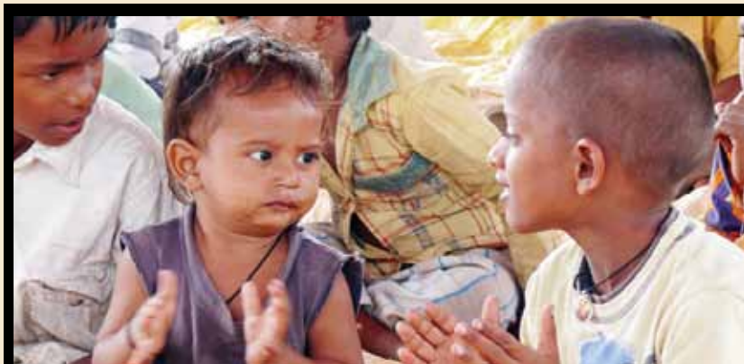
At-risk children: in need of our prayers

http://www.viva.org/world-weekend-of-prayer.aspx