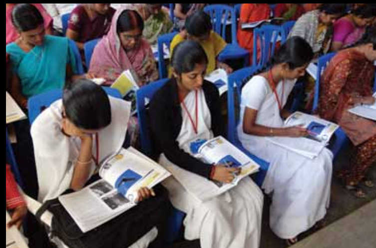
Girls diligently study materials in CSI seminar