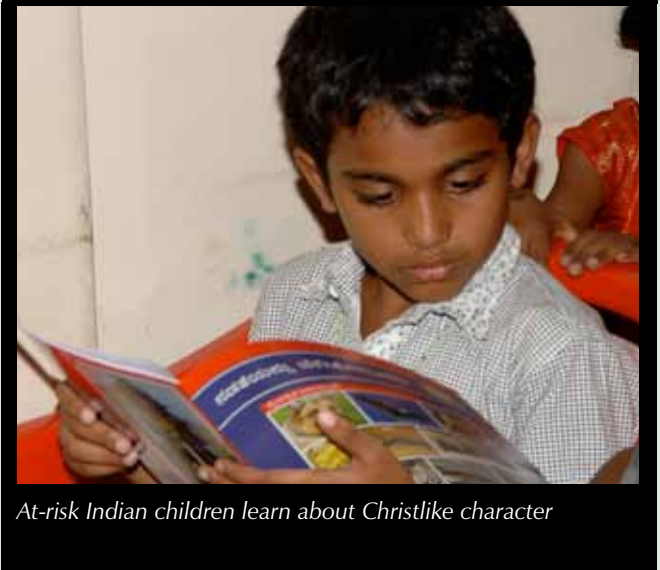
At-risk Indian children learn about Christlike character

Canada The Mission To Children PO Box 51143 RPO Beddington Calgary AB T3K 3V9