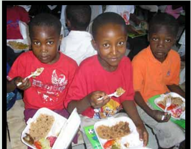
The school feeding program provides daily food for children

*For more details on the 3 Days of Prayer and Fasting in Haiti, check out this video: http://www.youtube.com/watch?v=30rWm84z-zg