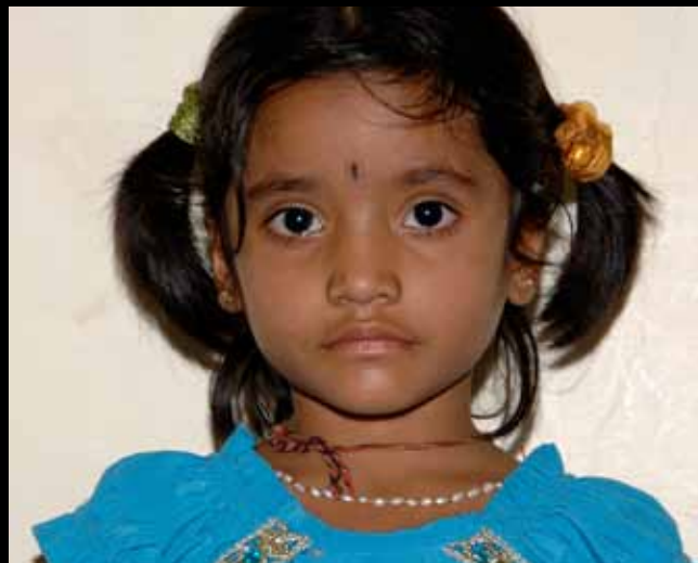
“God of the untouchables” prayer