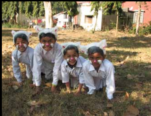
“God of little lambs” prayer

Would you be willing to help rescue a child at risk if all it cost you was time spent in prayer? You can do just that by participating in this year’s World Weekend of Prayer during the first weekend of June. We encourage you to recruit your friends, family, church members—and especially children—to join us in praying for the elimination of extreme poverty, hunger, disease, and violence toward those who are most vulnerable: at-risk children around the world. We believe our best protection for those in need is the power of God that results from prayer. For more details on what to pray for and ideas for prayer group activities, you can view a PowerPoint presentation or download a brochure at http://www.viva.org/ResourcesEnglish.aspx .