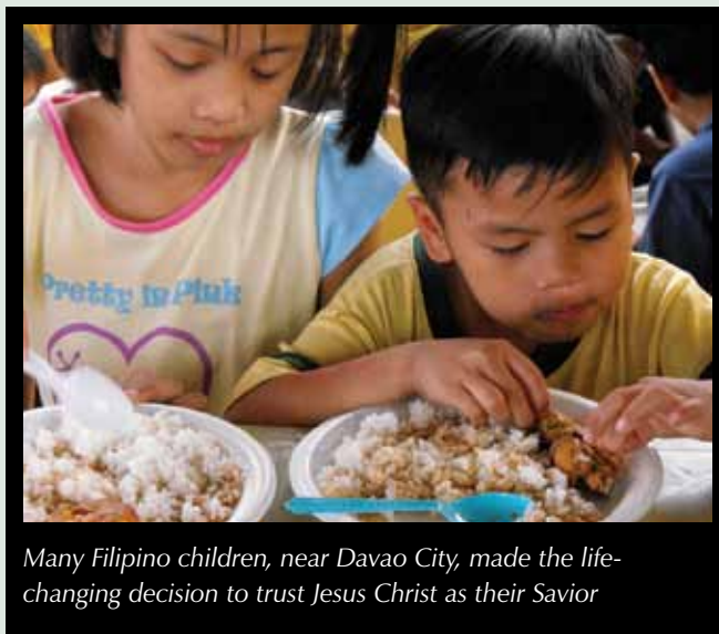
Many Filipino children, near Davao City, made the life-changing decision to trust Jesus Christ as their Savior

A Rural Setting in the Philippines: About 260 villagers and street children attended an open-air Christmas celebration. Some of the older sponsored children helped by being in charge of the program. They taught simple action songs and games, and presented a Christmas drama and a puppet show. The children enjoyed delicious