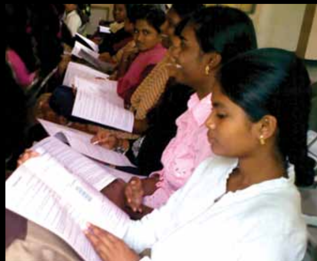
Indian students diligently learn descriptions of ten character qualities

I passed my high school certificate education last year. I was praying everyday to God to forgive my sin. I had an idea that it will continue for all my days of life. I cannot change my life. I attended the Character Cultivating class. The true stories . . . inspired me greatly. I understood the value of character. I thought if it is possible for them then why not me. They became role models for my life. My teacher told me that they did it because of the grace of Lord Jesus Christ. I prayed and surrendered my life that He will enable me to manifest His image and likeness. It is my sincere desire to be like Him and shine forth His life before my classmates and teachers."