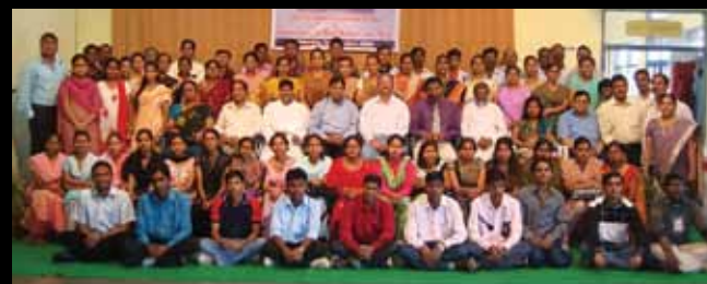
An entire medical staff takes Character Solutions training