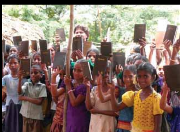
In Southern India these children proudly display their gift—God's Word—at the Christmas dinner outreach

“Though the mountains be shaken and the hills be removed, yet My unfailing love for you will not be shaken nor My covenant of peace be removed,” says the LORD, Who has compassion on you.” (Isaiah 54:10)