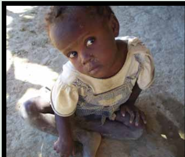
Please pray for the Haitian children and families who lost what little they had

We grieve over the thousands of people who lost their lives. MTC is collecting money so that our Haitian Christian partners can distribute food, blankets, clothing, and medical supplies—with God's love—to earthquake victims. 100% of designated donations will go to the Haiti crisis. We will provide updates on our website. We hope you will join us in prayer that God will use this disaster to bring many Haitians to Himself.