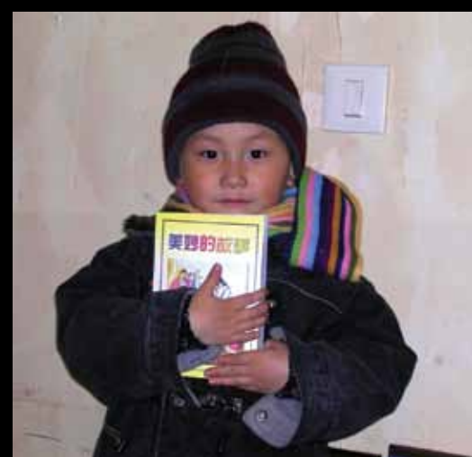
It is worth taking a risk so that Chinese children can learn about a personal relationship with Jesus and His offer of eternal life

Please join us in telling your friends who are U. S. Federal civilian, postal, and military employees that they can give to Mission to Children this fall through the CFC. When they select a charity the code for Mission to Children is #11922. MTC can be found in the Alpha Index or under Christian Service Charities. We believe financial participation in MTC will help build character that heals relationships and gives hope to distressed families locally and abroad. Thank you for spreading the word about this great opportunity for Federal workers to help cultivate Christlike character in at-risk children.