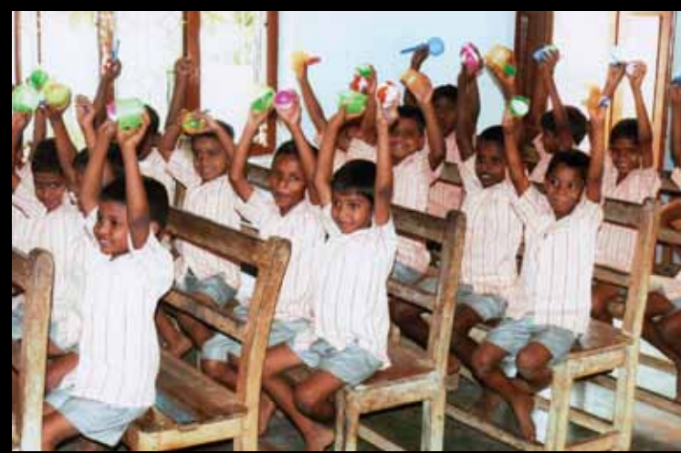
A small gift makes children feeling special and loved

Who attends MTC Christmas dinner outreaches? Street children, as well as destitute or blind elderly persons living in the same neighborhoods, families in leper communities, and sponsored children. 70-80% of children who become Christians do so between the ages of 4 and 14, so when the Gospel is presented clearly at these outreaches many children decide to follow Jesus. It is a time of celebration, not only on streets of dirt, but also on streets of gold with the angels in heaven.