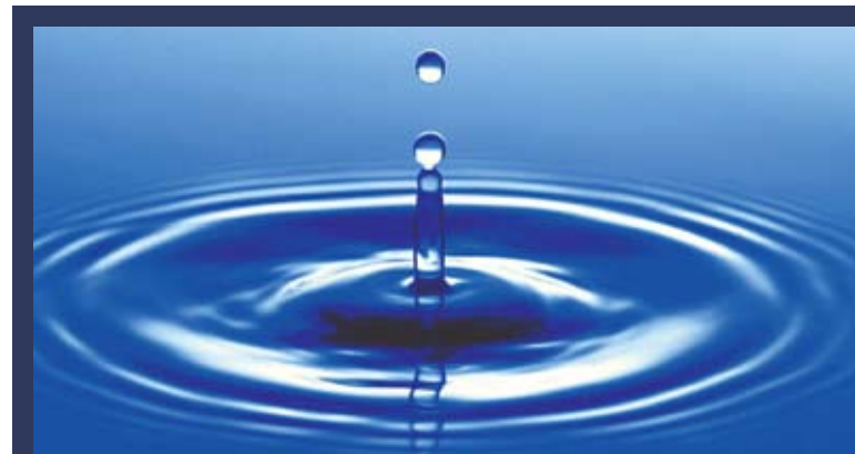
The Ripple Effect

Can you imagine the joy we will have when we all get to heaven and finally have the time and opportunity to meet some of these children whose lives were transformed by your and my heart-filled support and prayers during this three-year journey? The joy of that worship will make our journey worth it.