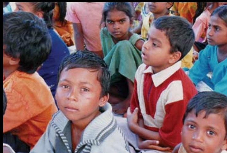
Hungry street children await a nutritious MTC meal

The Combined Federal Campaign invites U. S. Federal civilian, postal, and military workers to give to Mission To Children from September 1 - December 15, 2008. Please use Mission To Children's code #11922 when selecting a charity. MTC can be found in the Alpha Index or under Christian Service Charities. It takes months for us to receive the names of donors, so please be patient while waiting for our response. Read last year's results at http://www.missiontochildren.org/htmlCFC/ThankYouCFC.htm .