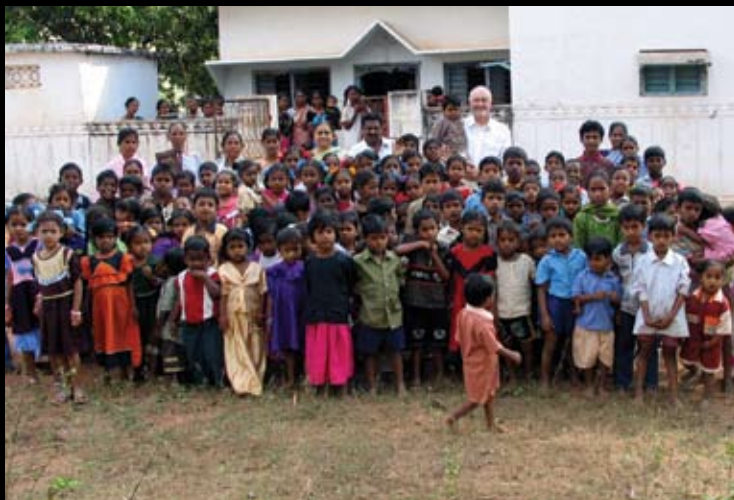
India: Reaching the next generation for Christ

Every day over 100 children learn about God's love while their parents work in the rice fields near Rajahmundry, India. These little ones are taught their school lessons by loving Christian teachers. They spend time singing, playing, and eating. MTC supports this worthwhile ministry for at-risk children monthly. Many of the children who attend are from non-Christian homes and this is a wonderful opportunity for them to hear firsthand about Jesus. If you choose to participate in the lives of these precious little ones please mark the line that says "Center for At-Risk Children" on the enclosure.