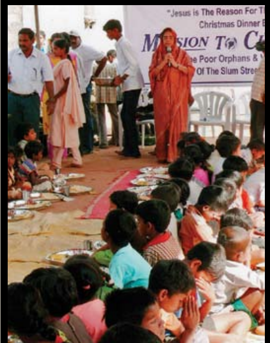
Giving a cup of water ...and more

Will you consider sharing a nutritious meal and a presentation of the Gospel by participating in the MTC Global Christmas Dinners? To allow our international partners time to adequately prepare, MTC must receive your gifts no later than November 15. We invite your heartfelt prayers and gifts so that these outreaches will bring joyous praise to God.