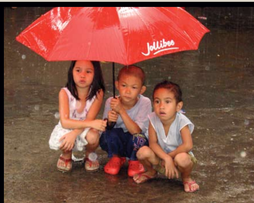
Rain doesn't dampen the spirit of Filipino children waiting for MTC Christmas celebration

"And this is the testimony: God has given us eternal life, and this life is in His Son. He who has the Son has life; he who does not have the Son of God does not have life. I write these things to you who believe so that you may know that you have eternal life." (1 John 5:11-13)