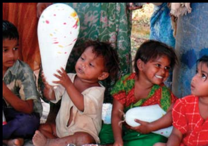
Indian children enjoy the Christmas gift of a balloon and a whistle

We invite you to join us in prayer for the many MTC Resurrection dinner outreaches being held during March. Our prayer is that the sentiment of a 10-year-old boy in India, “There is nothing called hope in my future,” will change to the belief that, “Kids like me now have hope.”