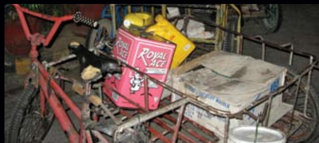
A work vehicle and a home for a Filipino "invisible child"