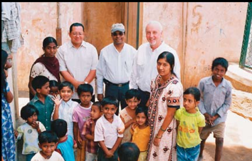
A warm welcome from the children in the leper community

Pray for the country's top military leader, General Than Shwe, and his soldiers. Pray that their eyes will be opened to see that God hates hands that shed innocent blood. Pray that they be released from the power of the evil one and that God's truth will penetrate the strongholds of darkness. Pray for believers to have boldness to share the Gospel and that God will miraculously supply their needs so they can continue reaching out with God's love (Matthew 5:44).