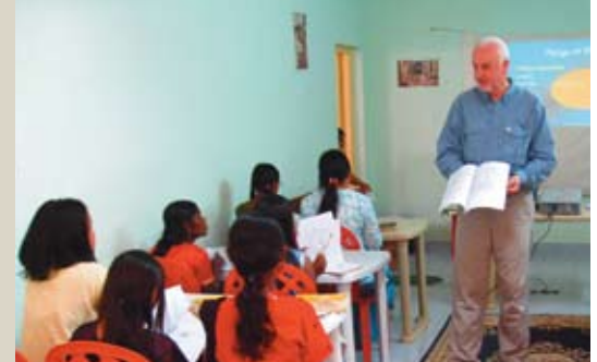
Reaching the next generation with God’s truth