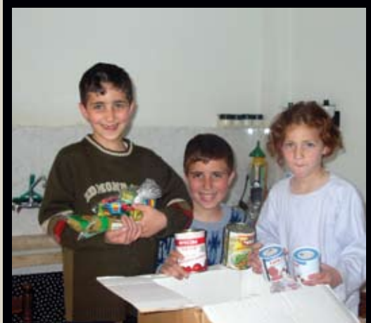
Food baskets help dispel the hopelessness and desperation families in Bethlehem face