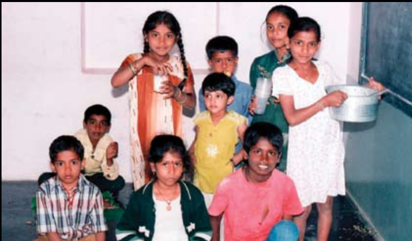
Anticipating a special meal

“I tell you the truth, whatever you did for one of the least of these brothers of mine, you did for Me” (Matthew 25:40).