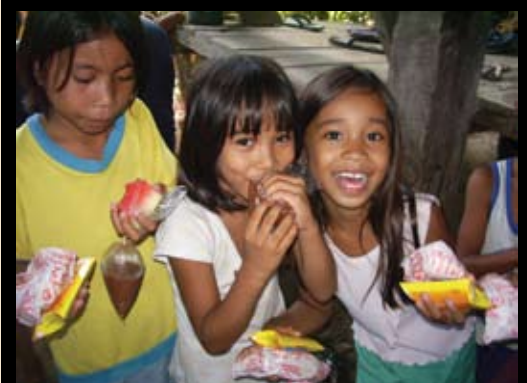
Filipina girls enjoy a Christmas treat before hearing about God's love

"Do not be deceived, my beloved brothers. Every good gift and every perfect gift is from above, and comes down from the Father of lights, with Whom there is no variation or shadow of turning." (James 1:16-17)