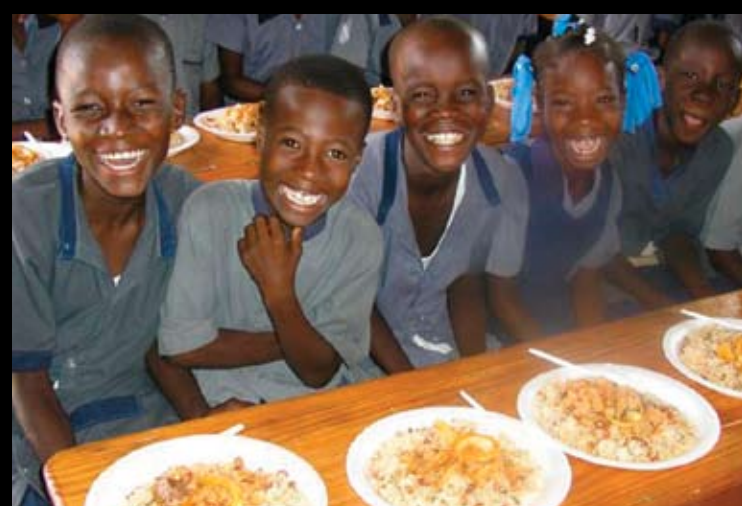
Hungry Haitian boys heartily enjoy food and fellowship

The Combined Federal Campaign invites U. S. Federal civilian, postal, and military workers to give to Mission To Children from September 1 - December 15, 2008. Please use Mission To Children's code #11922 when selecting a charity. MTC can be found in the Alpha Index or under Christian Service Charities. It takes months for us to receive the names of donors, so please be patient while waiting for our response. Read last year's results at http://www.missiontochildren.org/htmlCFC/ThankYouCFC.htm .