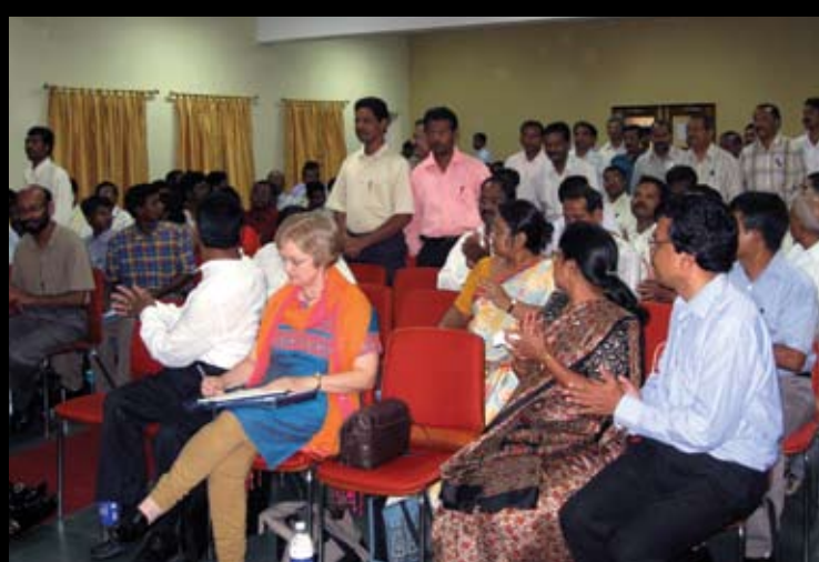
Pray for courage and conviction for Orissa pastors facing severe persecution