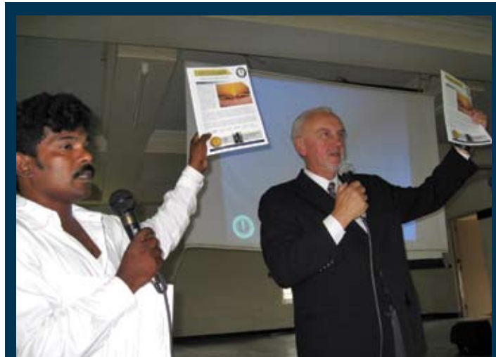
Indian pastor translates words from the Bible Teacher's Guide

On the home front, one man sent a check for $1,000, writing "The 'More Than A Million' project stirred my spirit to support it with $1,000 each year. It's exciting to be a part of this outreach." Another man read about that More than a Thousand for More than a Million (MTMM) concept in my September article and wrote, "The Lord moved me to participate in MTMM. Enclosed is $1,000 for my first year. You're right that our God doesn't need our money and it's all about the hearts." It stirred my heart to realize that these men "get it." They understand God's perspective and follow His Spirit.