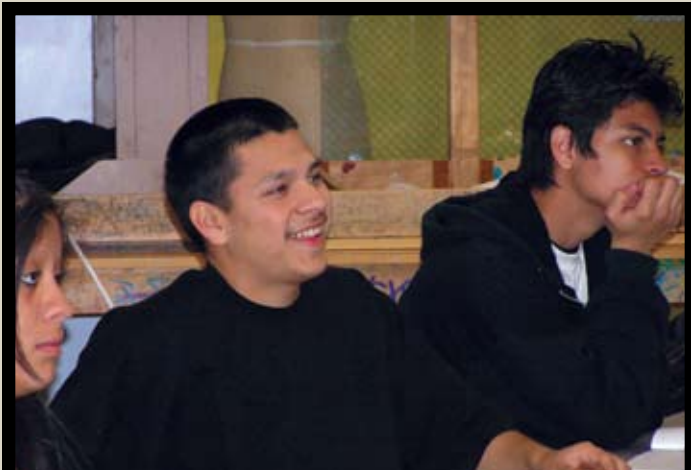
One student commented that he was encouraged by the leaders who took time to help him grow as a person of character

(For the reduced rate of $5 you can still order an MTC 2007 Prayer Diary.)