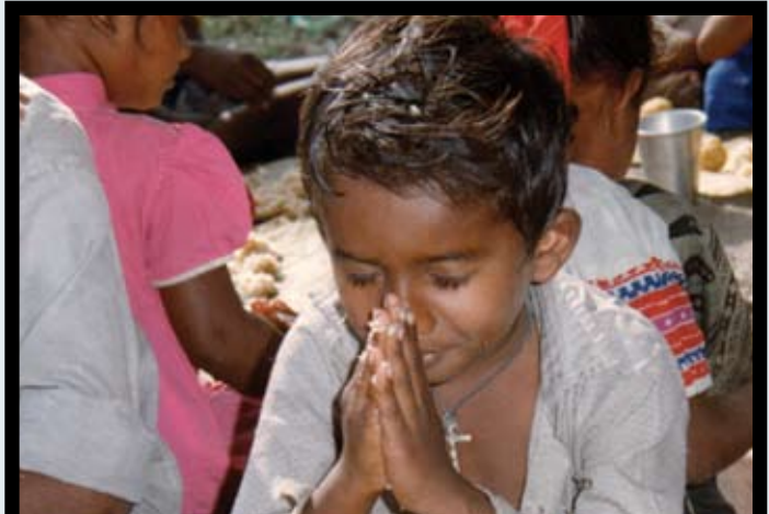
"He will respond to the prayer of the destitute; He will not despise their plea" (Psalm 102:17).