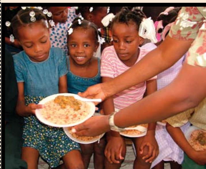
Without a feeding program these children are at risk of malnutrition

Pray that the power of God will crush the powers of violence, corruption, and fatalism that have held Haitians bondage for over two centuries. Pray that these precious people will no longer struggle to live day by day, but rather live abundant lives in Jesus Christ.