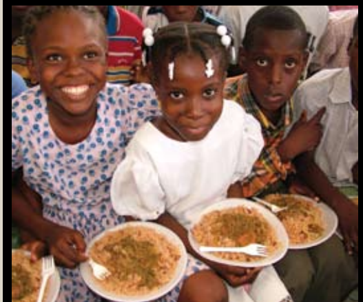
Children come in what is probably their only nice clothes to receive food and a Bible story