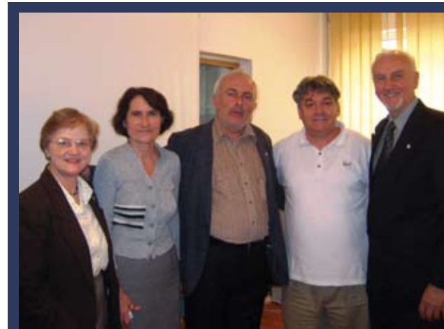
After the Gospel presentation the appreciative words of the Romanian orphanage principal and teachers warmed our weather-chilled week

"Comprehension plus competence minus character produces collapse."