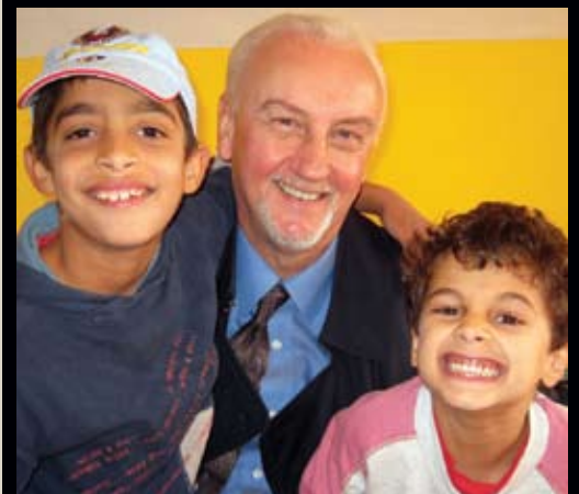
These children are learning godly character from their house parents in a Christian orphanage