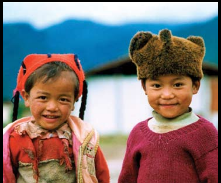
Pray that vulnerable children will not be misguided by atheistic teaching or cults

Let’s join together in praying for a growing recognition of human worth in China and an end to abortion, infanticide, and human trafficking. Pray for the safety of the millions of underground Chinese Christians and for their faith to remain strong as they live 2 Corinthians 4:8-9, “We are hard pressed on every side, but not crushed; perplexed, but not in despair; persecuted, but not abandoned; struck down, but not destroyed.”