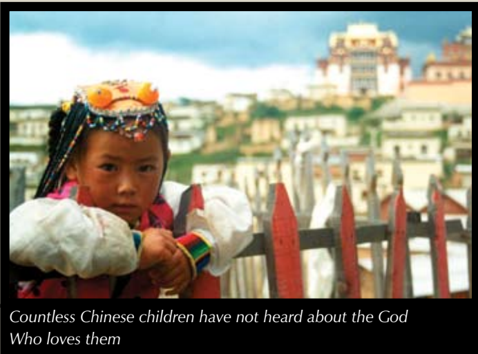
Countless Chinese children have not heard about the God Who loves them

"The fear of the LORD is pure, enduring forever. The ordinances of the LORD are sure and altogether righteous. They are more precious than gold, than much pure gold; they are sweeter than honey, than honey from the comb." (Psalm 19:9-10)